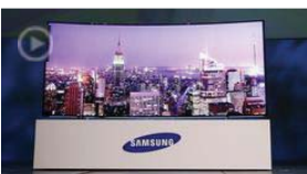
Five Steps to Improve the Look of Your TV Picture