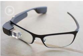
Google Shows Off Glass Video Games