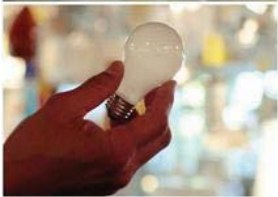
Switch Infinia LED: The LED Lightbulb for You?