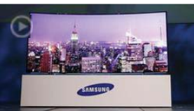
Five Steps to Improve the Look of Your TV Picture