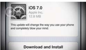
Is This Apple's iOS in the Car at Work?

your Instagrammed breakfast. But your grandkids may want to see their parent's baby pictures. Photos, truly meaningful ones, are meant to be passed down to future generations. Photographs are kept in families for decades. In the days when photography consisted of prints, that was easy to do. You'd simply hand over a box of prints. But today? It's not so easy.