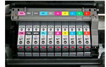
The Canon PIXMA Pro9500 uses a ten-ink version of the high-stability Canon LUCIA pigment inkset.

Price: Canon PIXMA Pro9500: $849.99 (USA) Canon Item Code: 0373B001. Printer started shipping in July 2007.