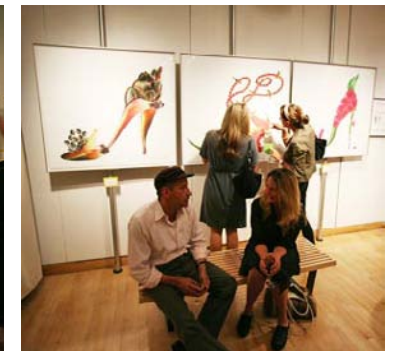
Original prints from the exhibition are available from www.shoefleur.com .