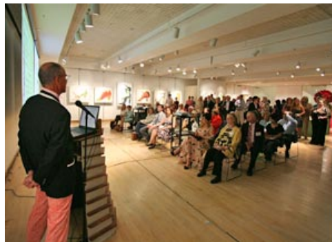
The gala event featured an illustrated lecture by Michel recounting the inspiration and evolution of Shoe Fleur .