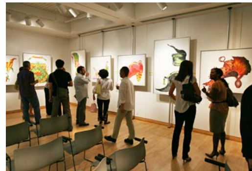
Exhibition prints were made by Michel using both the Canon PIXMA Pro9500 and imagePROGRAF iPF 8100.