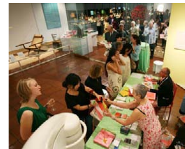
A book signing. People from fashion, publishing, and photography attended.