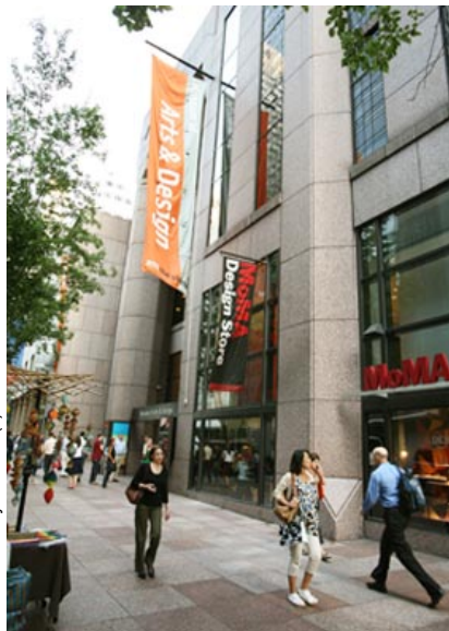
A reception and exhibition honoring Michel Tcherevkoff's book, Shoe Fleur – A Footwear Fantasy , was held at the Museum of Arts & Design in New York. The photographs were whimsical constructions of “women’s shoes and handbags” designed by Michel using the flowers, leaves, stems, and seeds of plants.