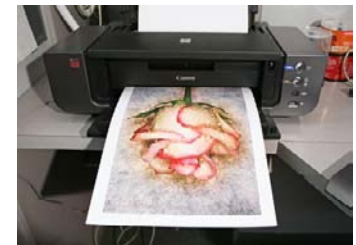
The addition of the red and green inks widens the color gamut and increases color brilliance. The two-level black and gray inks provide high quality black-and-white printing .