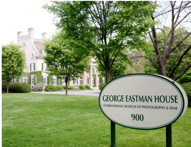
The International Museum of Photography & Film at George Eastman House in Rochester, New York has the most extensive collection of historical and modern color photographic processes found anywhere in the world.