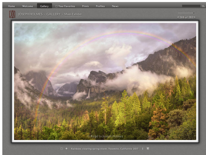
“Rainbow, clearing spring storm, Yosemite, California, 2017”