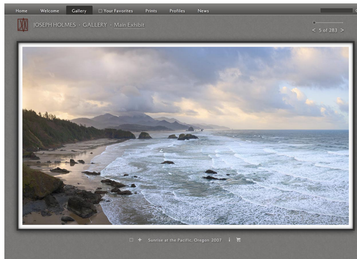
“Sunrise at the Pacific, Oregon, 2007”